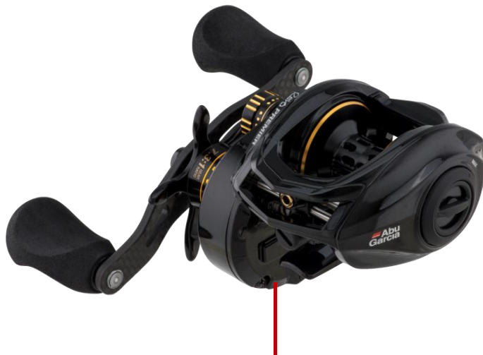
Maintenance Port Screw

As with any precision product, your Revo® reel will require regular maintenance. Gently rinse the reel with fresh water, wipe it dry and lubricate according to the accompanying diagram (picture of oil and grease points). Revo® Reels are equipped with a main gear access door called the Maintenance Port . This feature allows anglers to easily grease the main gear without taking the reel completely apart. To use this feature, locate the lube port screw pictured below.